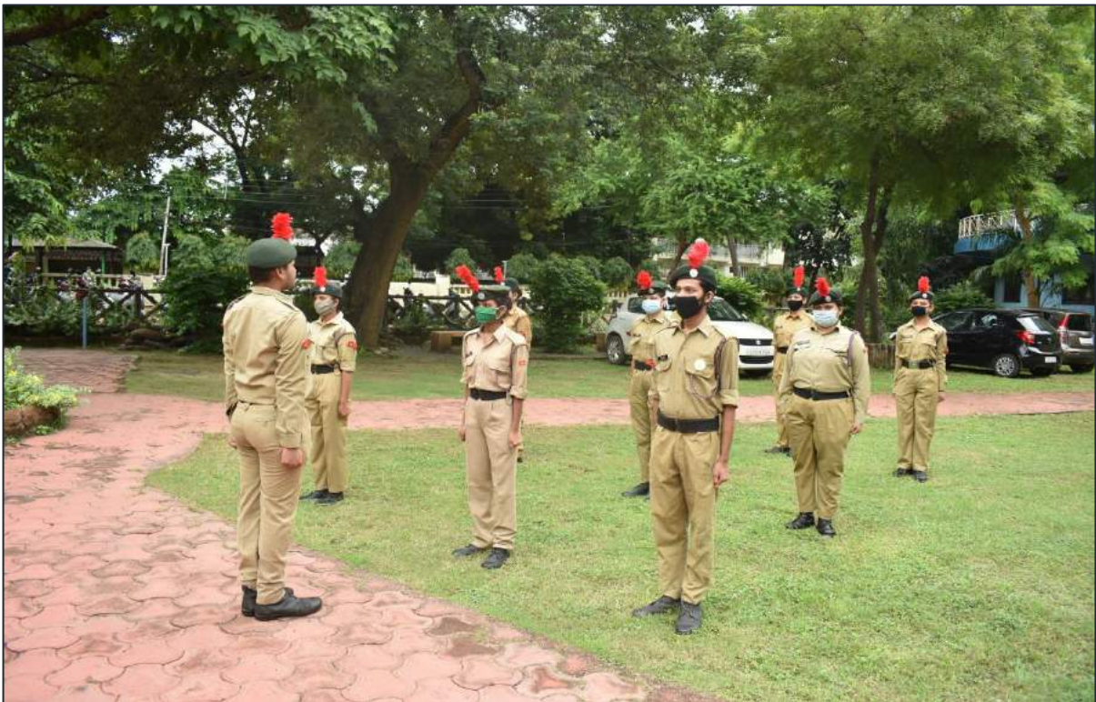
Figure 6-NCC Students Participation-15-8-2020