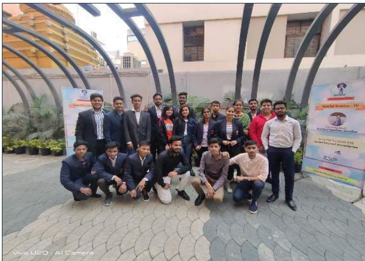
Figure 8-Students participation in ICAI session-24&25-January-2021