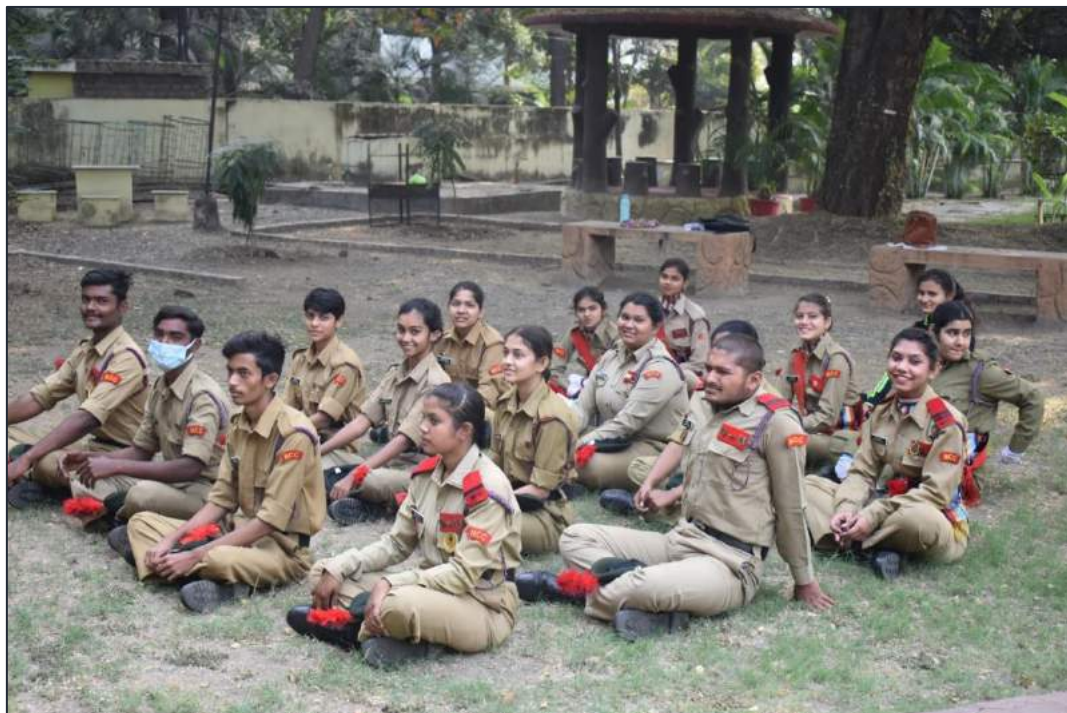
Figure 2- Figure 1- Participation in the Independence Day 15-8-2020