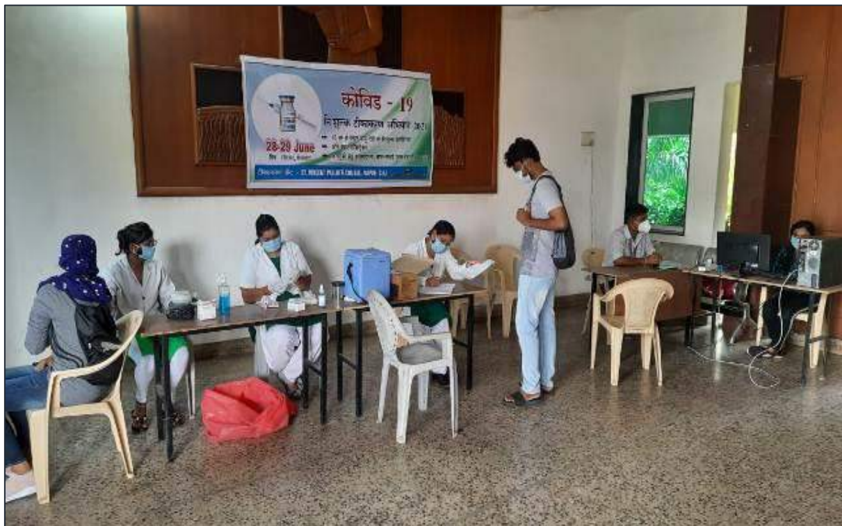
Figure 4- Participation in the Covid Vaccination Drive-28-6-2020