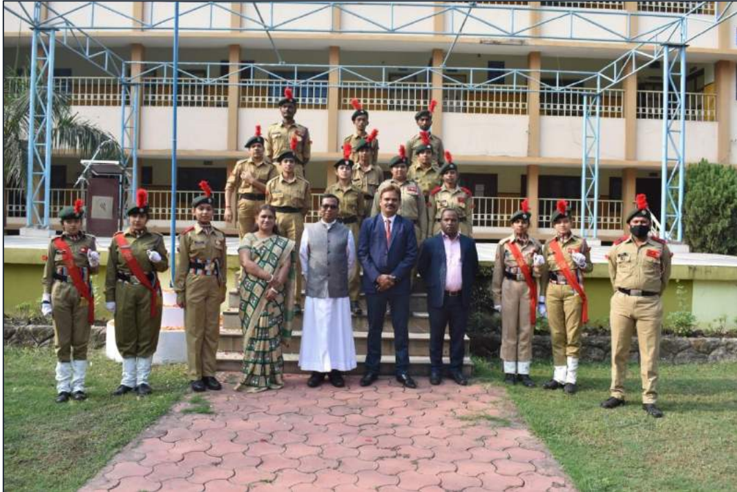
Figure 1- Participation in the Independence Day 15-8-2020