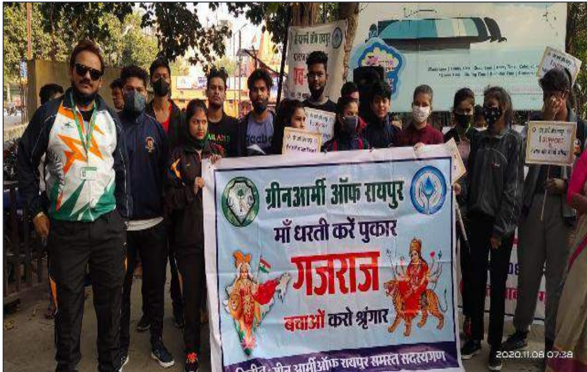
Figure 3- Participation in the Water Conservation Activity- 9-11-2021