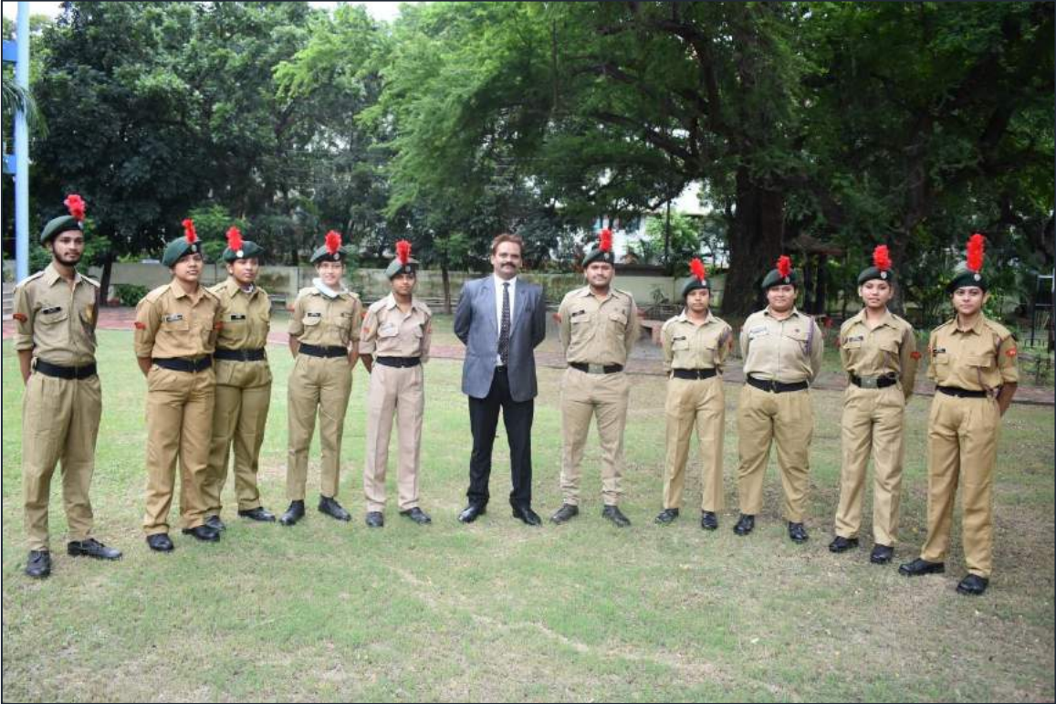
Figure 5- NCC students Participation-15-8-2020